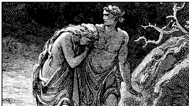
Adam and Eve, expelled from the Garden.

God did not cause Satan to deceive our first parents. However, God did permit it. God could have prevented Satan from deceiving Eve at all. God could have prevented mankind from learning, by this means, the natural consequences of sin and disobedience. But God wisely saw that this was the best means for people to learn what they must learn — to trust God’s moral laws as always best for their highest good. Only by this can man achieve, and fully benefit from, everlasting life.