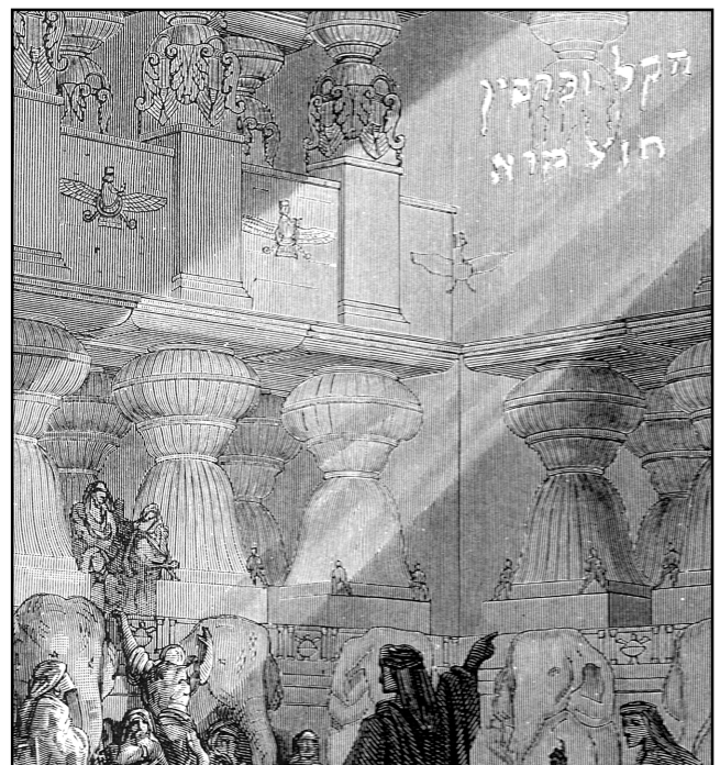
Mene, Mene, Tekel, Upharsin — weighed in the balances, found wanting, kingdom divided to Medes and Persians.

Notice the offer of “third ruler.” Belshazzar could offer no higher, since he himself was second ruler. This detail again shows the accuracy of Daniel’s report.