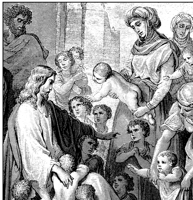
"Whosoever therefore shall humble himself as this little child, the same is greatest in the kingdom of heaven" (Matthew 18:4).

Whoever has our Lord's spirit, and is controlled by the same will, is a member of the Body of Christ, and will seek to walk after this fashion, to do the will of God in all things. This will mean a walk of holiness, of full devotion to God, and of opposition to sin. Whoever is consecrated to God is opposed to every sinful thing; for God and sin are in antagonism. God stands for His own righteousness, and sin is a violation of that righteousness (1 John 3:4). Whoever walks as Jesus walked is in harmony with the divine word and will. We are not to trust to our impressions, our own conceptions of what is right and advantageous, as many others do; but the Word of the Lord is to abide in us, and to govern our lives. Jesus said, "I came not to do Mine own will, but the will of Him that sent me" — "everything written in the Book." And so it