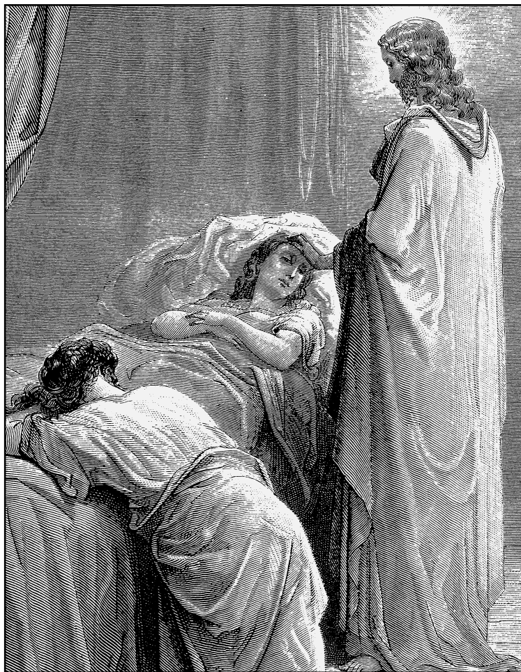
Jesus raising the daughter of Jairus — an illustration of the Resurrection of all, during the Millennium.

Verse seven indicates the enlightenment will occur gradually. When God introduces the Kingdom through the deliverance of Israel, it will be “not day nor night” — the world will be neither fully light nor fully dark — but a mixture. But by the end, light will prevail everywhere.